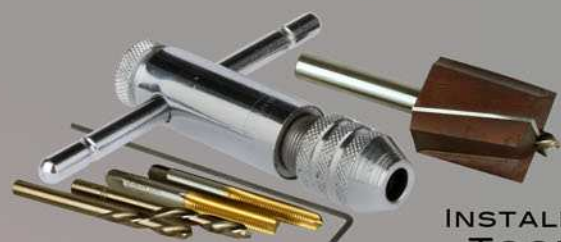
INSTALLATION TOOL KITS