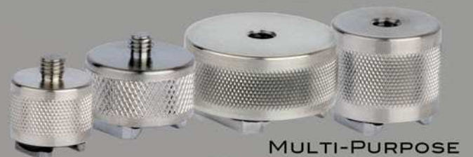
MULTI-PURPOSE MAGNETIC BASES