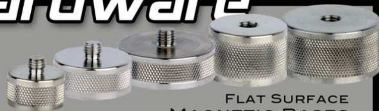
FLAT SURFACE MAGNETIC BASES