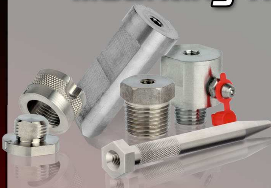
QUICK DISCONNECTS MOUNTING ADAPTERS/PADS