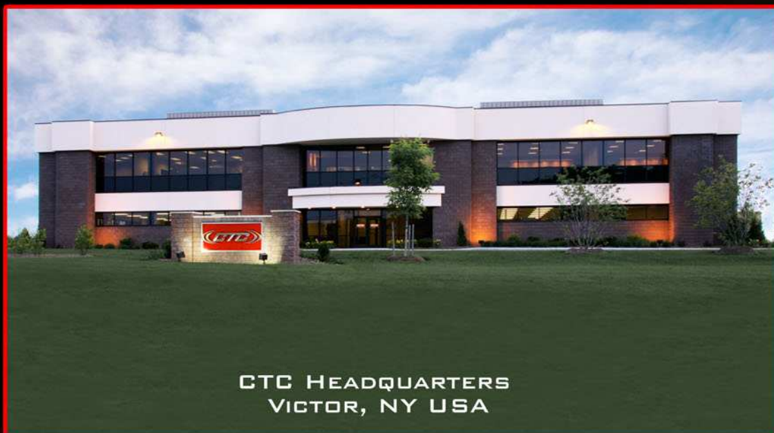
CTC HEADQUARTERS VICTOR, NY USA